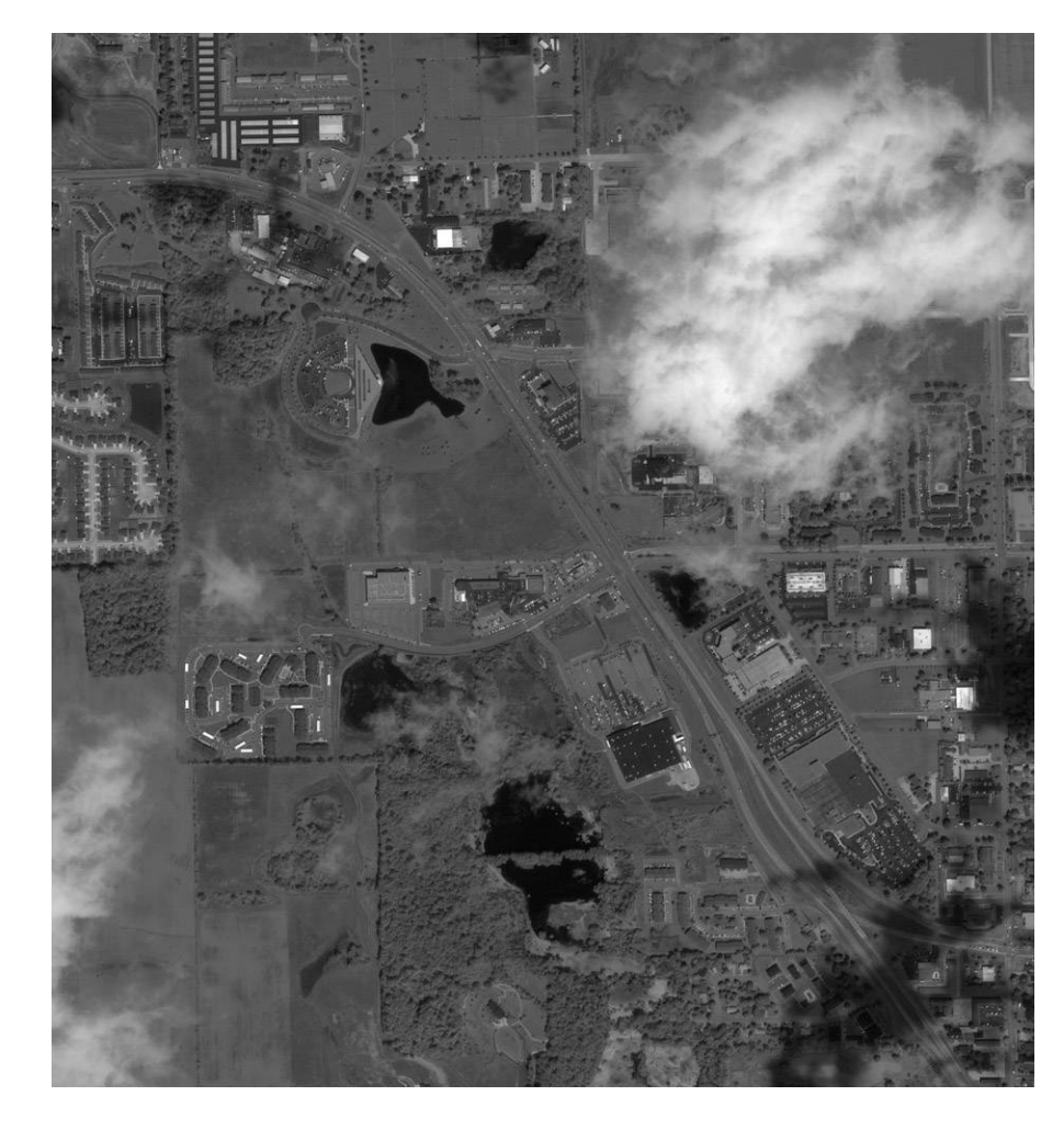
RTV Airborne SAR